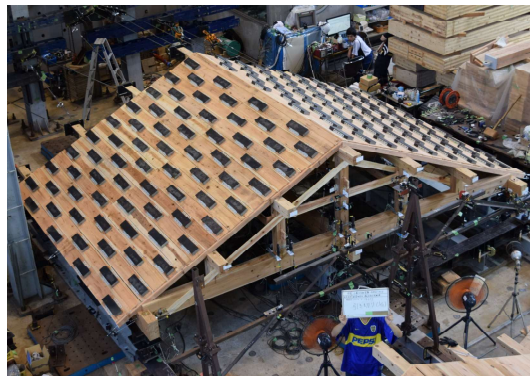
Full-scale lateral force test of a traditional gable roof frame