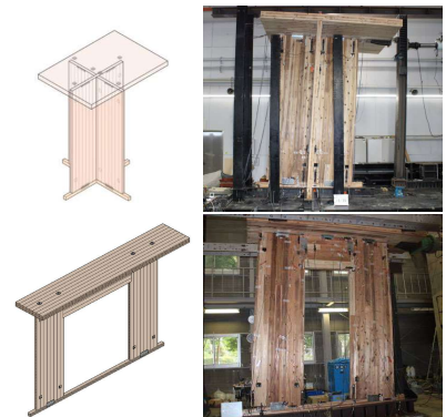
Full-scale lateral force test of shear walls by CLT panel construction