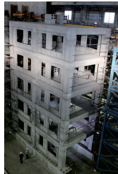
Resilience of five story buildings tested at Building Research Institute (Tsukuba)

The ultimate goal of our research group is to contribute to the society by making structures resilient against various disturbances such as earthquakes, tsunamis, and wind. Research topics cover seismic assessment, seismic retrofit, performance based design, damage controlling system using reinforced, precast and prestressed concrete structures. We look forward to working with people interested in concrete structures.