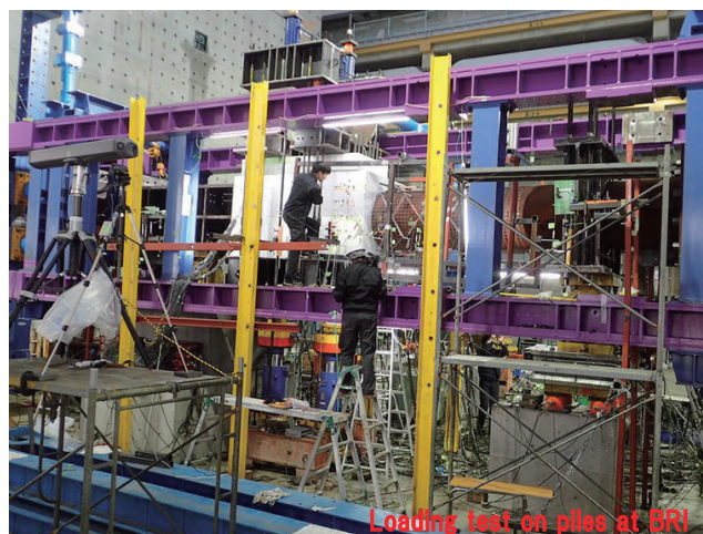
Loading test on piles at BRI