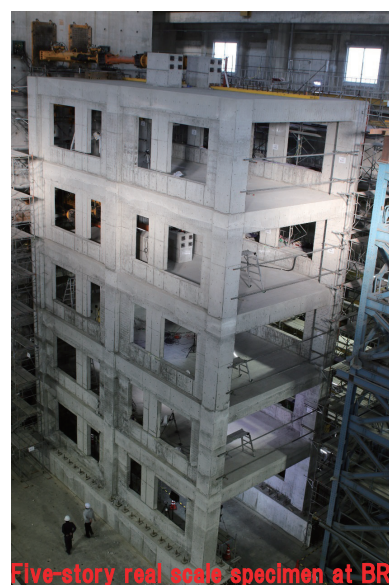
Five-story real scale specimen at BRI

The ultimate goal of our research group is to contribute to the society by making structures resilient against various disturbances such as earthquakes, tsunamis, and wind. Research topics cover seismic assessment, seismic retrofit, performance based design, damage controlling system using reinforced, precast and prestressed concrete structures. We look forward to working with people interested in concrete structures.